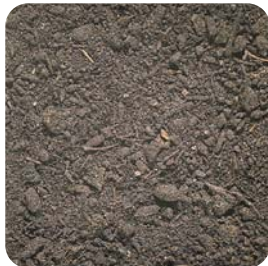
Compost with NPK