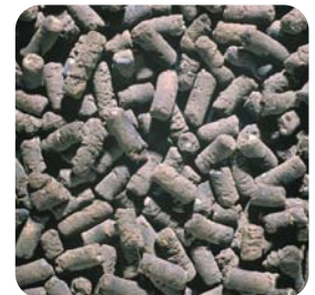
Dried pelleted compost with NPK