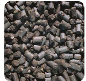
Pelleted compost with NPK