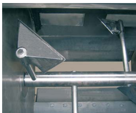
Mixer interior with ventilation openings and double bottom flap