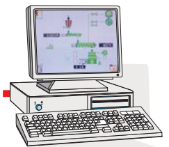
KAHL service team