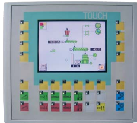
EAPR operator panel