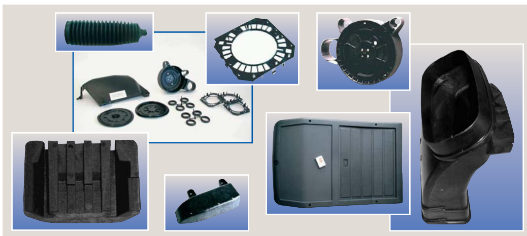
Recycling products from waste tyre rubber