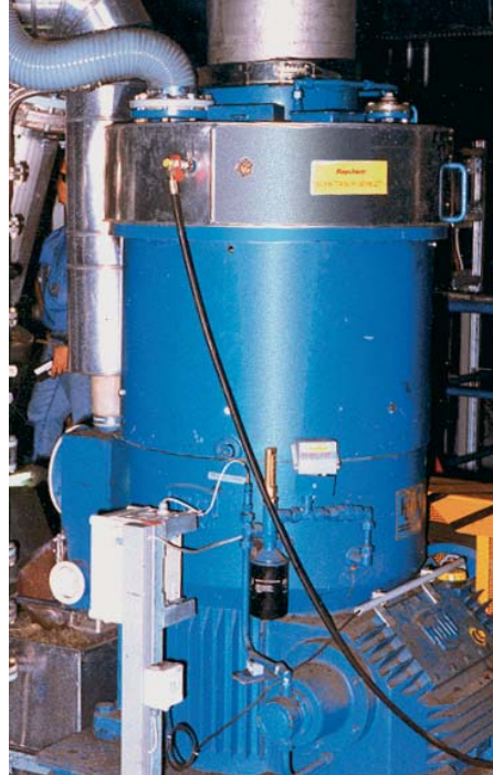
Pelleting press for the production of sewage sludge pellets

The bulk density of the sewage sludge pellets is about 800 kg/m 3 . The dust content is very low with < 1 % referred to a dust particle size of < 0.5 mm. All other fines do not cause dust nuisance during further treatment.